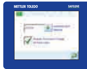
Dedicated 21 CFR part 11 mode with dual-level user name and password access login

Individual operators can be assigned personal login user names and password details with their own user profile which can display information in a choice of 18 languages. This feature can be used to restrict unauthorised access to the operating system.