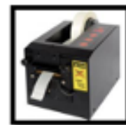
Semi-Automatic Tape Dispenser