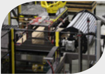
Robot moves to slide the product off the table end while the floor of the MasterPal™ tool moves simultaneously replacing the table with the floor of the tool until the layer is completely captured within the tool.