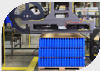
MasterPal™ tool slatted apron retracts to place formed layer atop the waiting pallet/lower layer. Then the clamping system retracts and the robot raises the tool above the pallet.