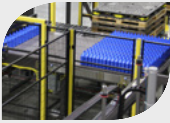
Currie custom layer forming.