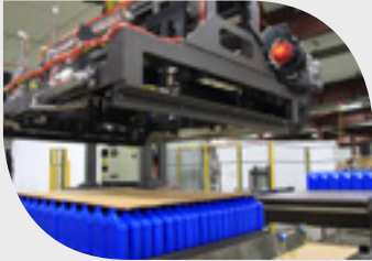
MasterPal™ tool then lowers over the formed layer on the pick table to capture the product. The internal tool clamping energizes to stabilize the product within the formed layer.