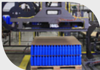
Robot moves to the pallet load position and lowers next layer level.