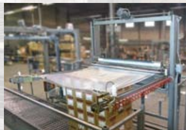
Top Sheet Dispenser (Wrap area model also available)

Not all options available on all models. Consult your local Orion distributor.