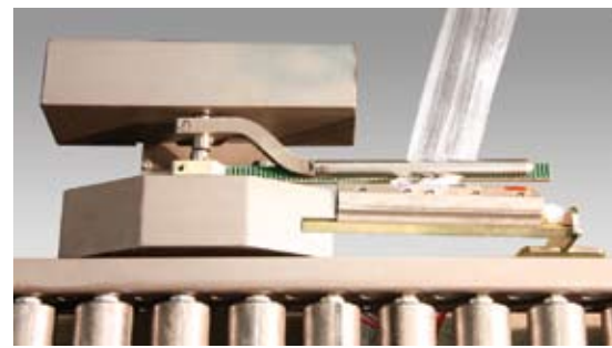
Pneumatically operated film clamp with high grip clamp for reliable grip & release of film tail

As part of Category 2 safety rating the MA features full wire mesh enclosure surrounds the wrap area of the MA-X. Two electrically interlocked doors on the film tail side allow for convenient yet secure entry to the wrapping zone.