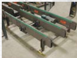
Chain Transfer Conveyor