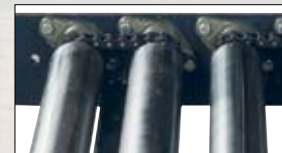
Xtra-Duty conveyor detail