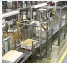
6-Sided Wrapping System