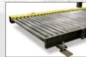
Low Level Conveyor