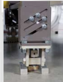
Conveyor Leg Load Cell