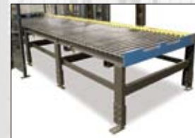
High Level Conveyor