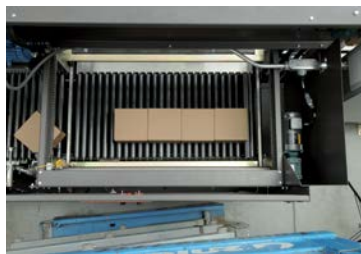
B. Cases convey into the row forming area where each layer is formed one row at a time.