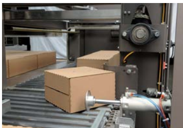
A. Cases enter an LL Series Palletizer where the case/tray turner and case stops help form the desired row pattern.

Design includes important safety features, such as a framed guard door package, CAT II safety circuits and muting light curtains. The CAT II safety meets the requirements of the most stringent safety programs. CAT III safety is also available as a low cost option.