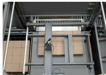
C. The row sweep pushes each row onto the elevator, forming a layer one row at a time. The elevator then positions the layer over the top of the load, extends and places the layer on the load.