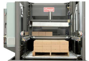
D. Once layers are complete, the pallet exits the LL Series Palletizer.