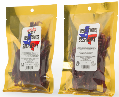
Beef jerky packages labeled with the ELF-20 shown with customer permission

In strict compliance with Good Manufacturing Practices (GMP) standards, the ELF-20 is made of 304 stainless steel and anodized aluminum, and carefully treated to guard against the effects of harsher environments. Additionally, its simplistic design enables quick fixes and easy adjustments. Given this durability and easy maintenance, the ELF-20 affords you a solid choice in labeling machine longevity.